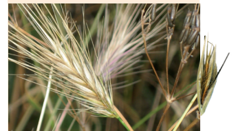
Grass awns of the summer grasses are a perennial hazard