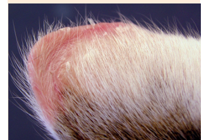
Ear tip of a cat showing cancerous changes with skin reddening.