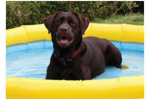
Paddling pools are a great way for dogs to stay cool in the summer!

So – if you would like further information on the benefits of insuring your pet, please don't hesitate to contact a member of our team.