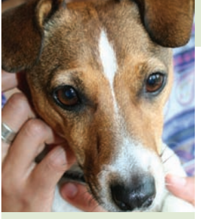
Healthy eyes are open and comfortable and free from discharge. Light is seen to reflect from the moist, healthy cornea

Finally, have fun with your pets and stay safe over the festive season!